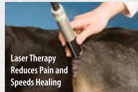
Laser Therapy Reduces Pain and Speeds Healing