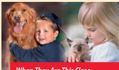
When They Are This Close – You Want Them Both Protected!

ZOONOSIS refers to a parasite or disease, like rabies, that can be passed from animal to humans. Members of your family can unknowingly pick up zoonotic parasites at the park, on a sidewalk, or even in their own backyard. Since children often play outside, they are the most at risk for disease transmission. In addition, individuals who are pregnant, elderly persons, people receiving chemotherapy or anyone who is immunocompromised, can be at risk.