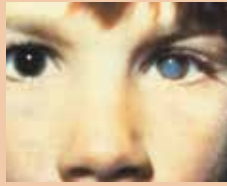
Pictured above: Ocular manifestation of the roundworm ( Toxocara canis ) in a young child with resulting vision loss.

Waunakee Veterinary Clinic considers parasites and zoonotic disease transmission a serious health concern. We want to provide our clients with the information and safeguards required to protect both you and your pet(s).